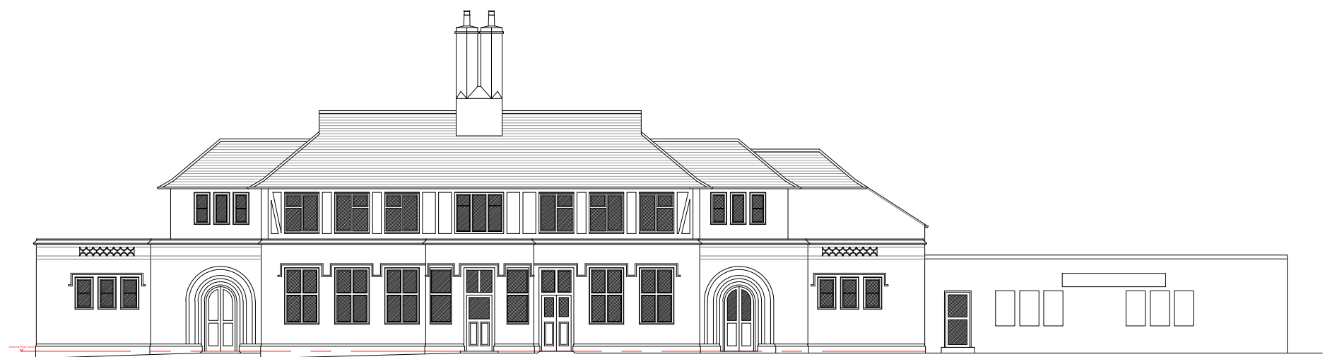
EXISTING FRONT (SOUTH) ELEVATION