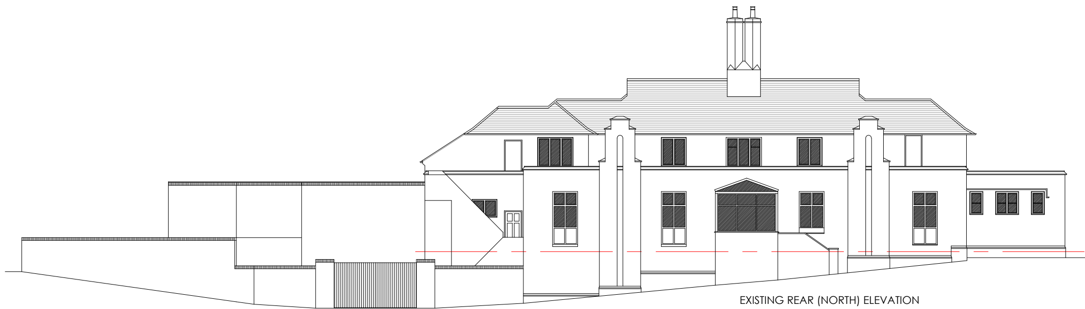
EXISTING REAR (NORTH) ELEVATION