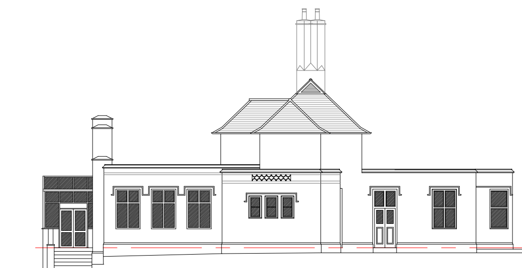
EXISTING SIDE (WEST) ELEVATION